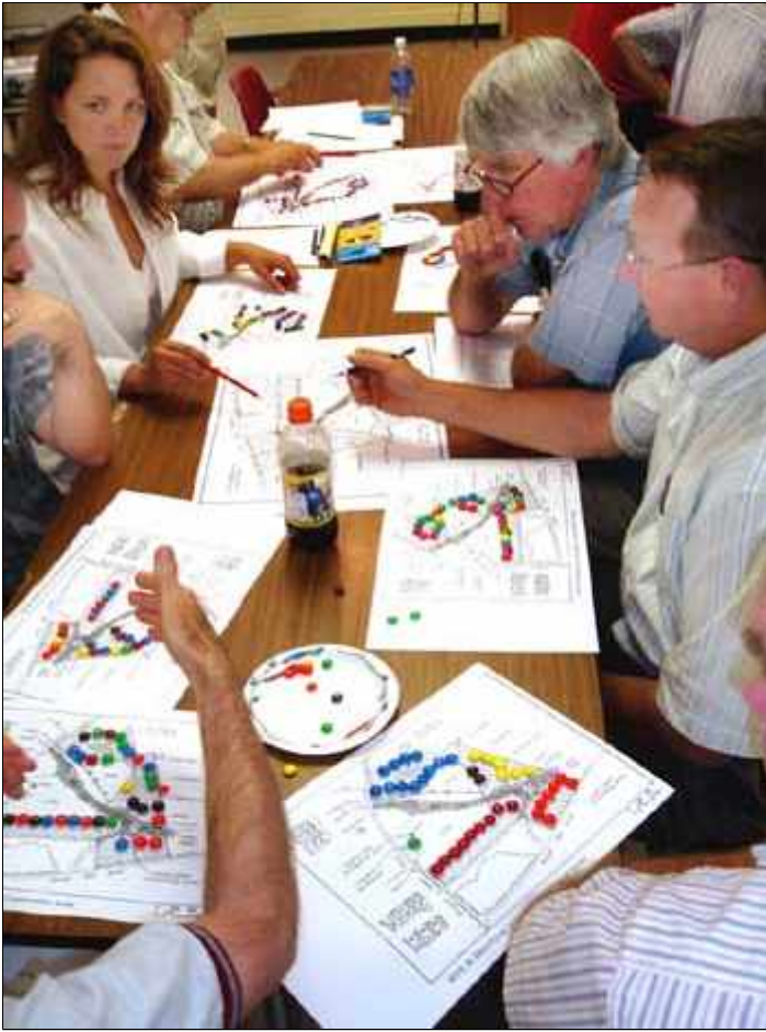
Workshop participants discuss options

Streets and trails come next, and then the lot lines are drawn in.